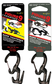
Single Pack (Stainless/Black Gates Available)

Retail Packaging Dimensions: 6.5"H x 2.3"W x 0.25"D 165.1 mm H x 58.4 mm W x 6.4 mm D