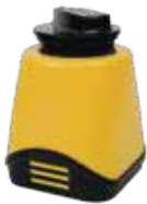
Battery and Charging Station