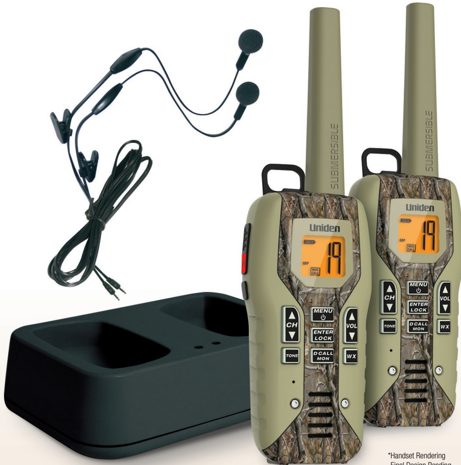
*Handset Rendering Final Design Pending.