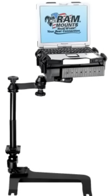
Complete Vehicle Mount RAM-VB-159-SW1

8410 Dallas Ave S Seattle, WA 98108 Phone: (206) 763-8361 Fax: (206) 763-9615 Website: www.ram-mount.com Email: staff@ram-mount.com