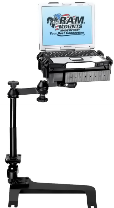
Complete Vehicle Mount RAM-VB-159-SW1