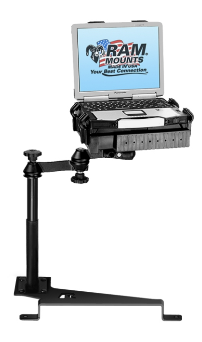
Complete Vehicle Mount RAM-VB-172-SW1

Installs in minutes with no drilling required. Lifetime warranty!