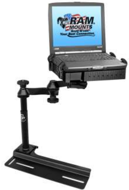
Complete Vehicle Mount RAM-VB-106-SW1

8410 Dallas Ave S Seattle, WA 98108 Phone: (206) 763-8361 Fax: (206) 763-9615 Website: www.ram-mount.com Email: staff@ram-mount.com