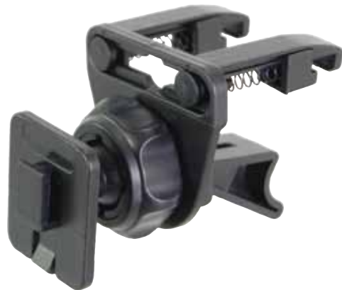
360° ROTATING AIR VENT MOUNT