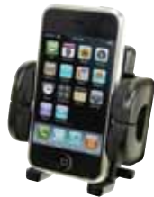
MOST IPOD®/IPHONE® MODELS