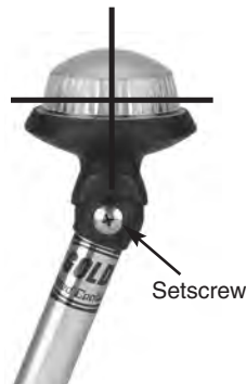
Note: Clear Globes Must Be Vertical During Operation.