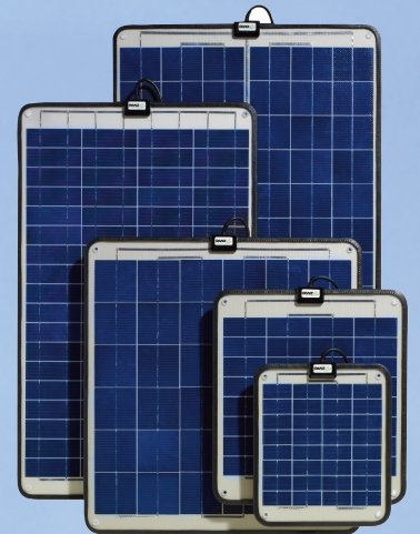
GSP Series Solar Panels