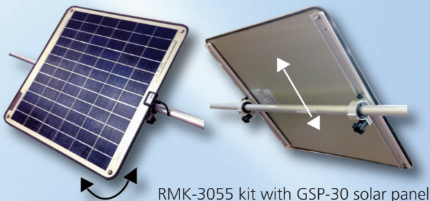
RMK-3055 kit with GSP-30 solar panel