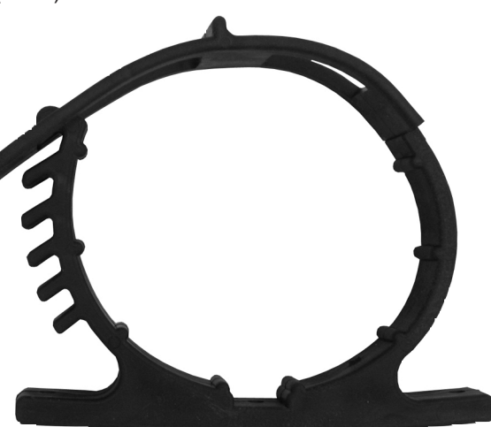
#544 Super Quick Fist®

For mounting smaller equipment or tools, use standard size Quick Fist (#540)