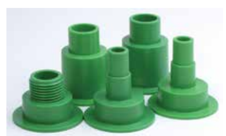
Dual-size hose adapters (5/8+3/4 in. combo, 1+1.5 in. combo) and threaded adapters make replacing previous vent filters easy.

for the most popular vent hose sizes are included with the complete vent filter kit (309311001). Threaded adapters are also included for replacement on many older SeaLand holding tank systems with built-in vent filter.