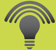
Xenon Strobe LED Flashlight