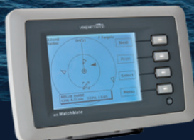
WatchMate 850 AIS TRANSPONDER