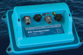
XB-8000 smartAIS TRANSPONDER