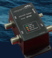
SP-160 AIS VHF SPLITTER

THIS IS A FANTASTIC PIECE OF KIT. THE MENUS ARE SIMPLE AND EASY TO USE. EVEN WHILE IN A HEAVY SEAWAY, IT'S INCREDIBLY SMART ABOUT CONSERVING POWER AND BEST OF ALL IT HAS THE SMARTEST ALARMS I'VE EVER SEEN ON AN AIS DEVICE.