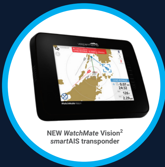
NEW WatchMate Vision 2 smartAIS transponder

Vesper Marine is dedicated to safety on the water for sail, power and work boats. Our award-winning smartAIS transponders are designed by the Vesper Marine engineering team with an unwavering focus on quality, exceptional value and outstanding customer support.