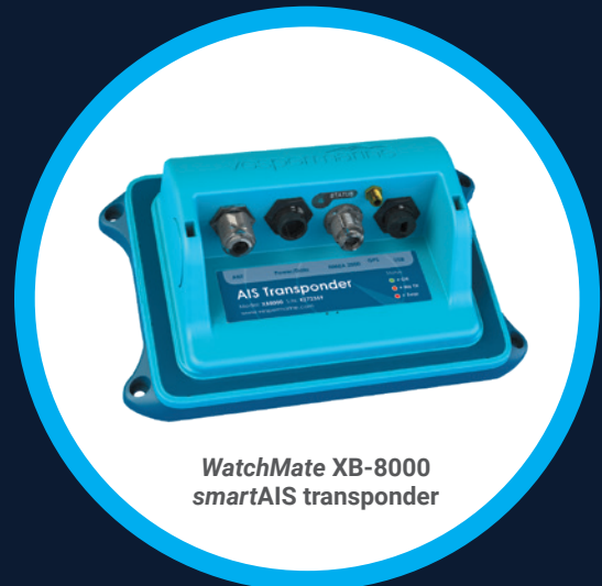
WatchMate XB-8000 smartAIS transponder

vespermarine smartAIS ® OFFICIAL SUPPLIER