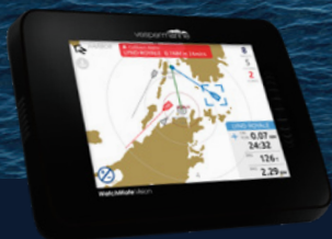
New WatchMate Vision 2 smartAIS TRANSPONDER

ALWAYS ON ALWAYS VISIBLE ALWAYS WATCHING