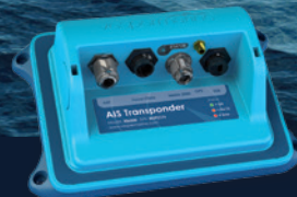
XB-6000 AIS TRANSPONDER