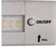
Built-in On/Off Touch Dimmer