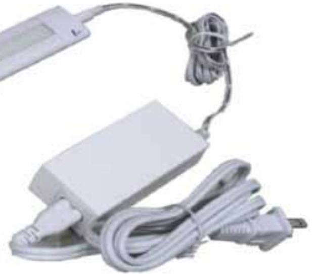
LLB-17HP-31-00 12VDC Power Supply, 100-240VAC In, 24W