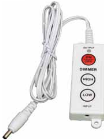
LLB-32KT-01-00 Remote On/Off/Dimmer`