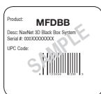
*Sample UPC Label