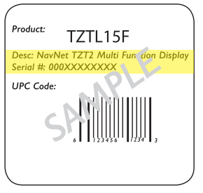
Sample UPC Label