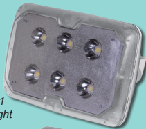
F38-4600WHA-1 LED Spreader Light