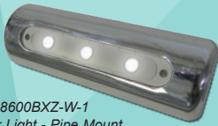
F38-8600BXZ-W-1 LED Deck Light - Pipe Mount