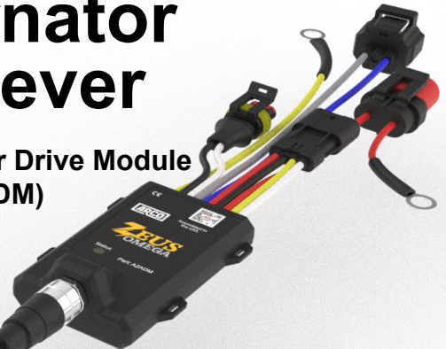
The Alternator Drive Module (ADM)