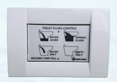
Smart Toilet Control STC