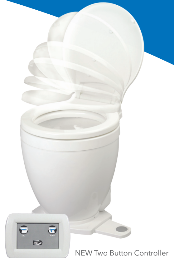
NEW Two Button Controller