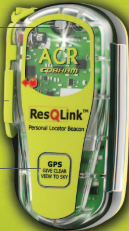
Product shown actual size 3.9"