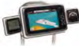
Two SP1BOX on a SPOD .

SP1BOX allows you to mount additional instruments to your SPOD or DPOD .