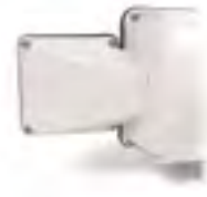
Back view of SP1BOX .