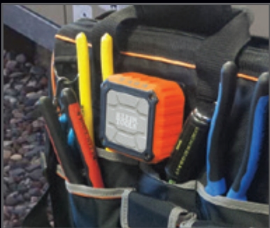
Twist-lock flange on back mounts to Klein's Lighted Tool Bag, Cat. No. 55431