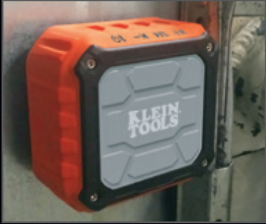
Powerful rear magnet holds speaker securely to metal surfaces