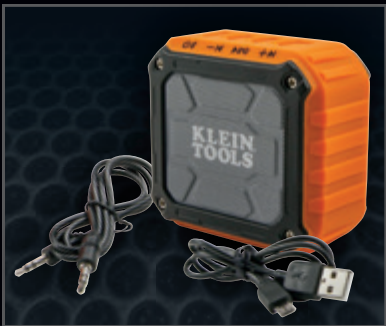
Includes 1/8" (3.5 mm) stereo auxiliary cable and micro USB-to-standard USB charging cable

The Klein Tools AEPJS1 is a powered speaker that provides 5 watts of high-quality sound for smart phones, tablets, computers and other audio devices via a wireless Bluetooth* connection or wired auxiliary input. It answer calls hands-free with the built-in speakerphone and can be magnetically attached to any steel surface, attached to Klein's Lighted Tool Bag (Cat. No. 55431), mounted to a standard 1/4-20 tripod, attached to a lanyard, or simply stood up on any solid, level surface.