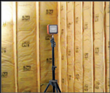
1/4-20 threaded mount on bottom allows attachment to any standard tripod