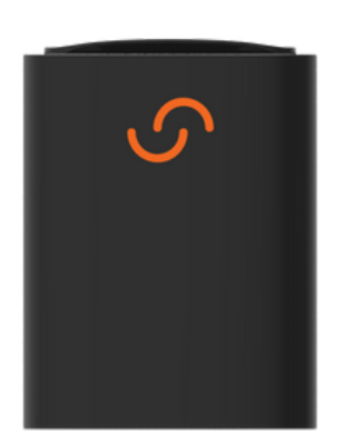
Siren Marine wireless sensors are easy to install and ideal for hard-to-access places.