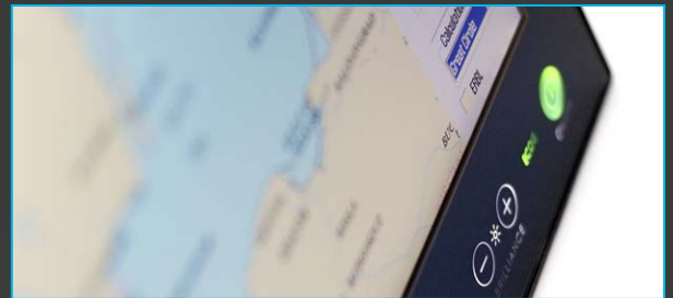
GLASS DISPLAY CONTROL™