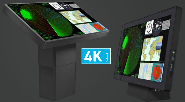
55" Chart / Tactical Table