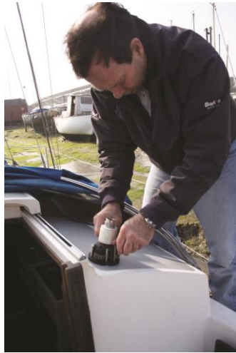
Offering up bolts