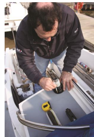
Marking bolt holes