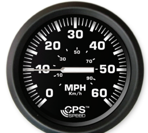
Scale may vary depending on mode