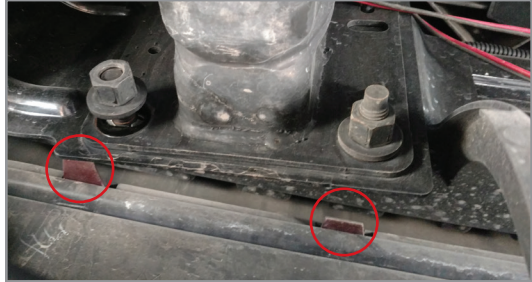
Retention Tabs and Bumper Bolts