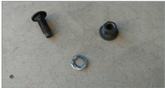
Bumper Bolt, Nut, And Retaining Clip

*Note: It may help to loosen the upper bolt as well, this will allow the bumper to be tilted up to allow the retaining clips to fall out.