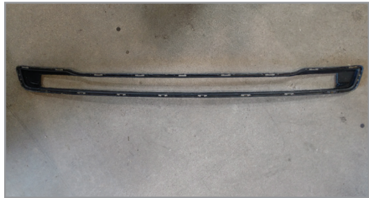
Finish Trimming by Cutting Just Inside the Horizontal Bezels (40" Width Shown)