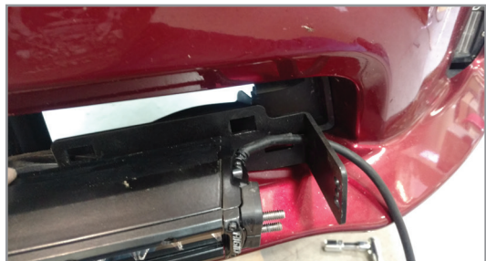
40" Light Bar mount with Wire Ingress Routing

30" light bar: Mount the brackets onto the bumper brackets with the light bar mount tabs inwards, utilizing the outer bumper mounting bolts.