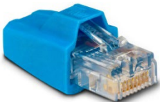
RJ45 VE.Can terminator