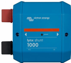
Lynx Shunt VE.Can