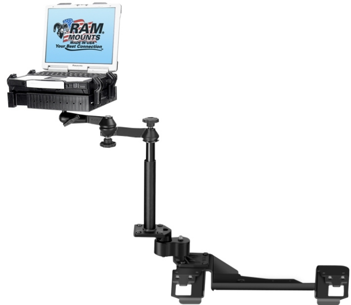
Complete Vehicle Mount RAM-VB-182-SW1

Low profile minimized intrusion into passenger leg space