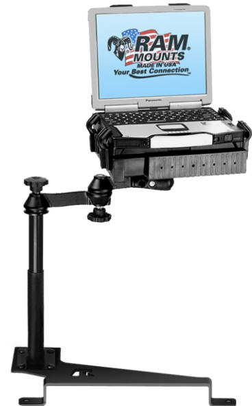
Complete Vehicle Mount RAM-VB-172-SW1

Installs in minutes with no drilling required. Lifetime warranty!