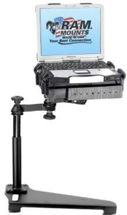
Complete Vehicle Mount RAM-VB-152-SW1

Installs in minutes with no drilling required Low profile keeps mount away from passenger leg space Lifetime warranty