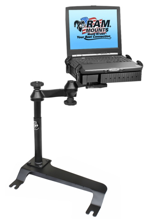
Complete Vehicle Mount RAM-VB-192-SW1

Installs in minutes with no drilling required Won't interfere with levers