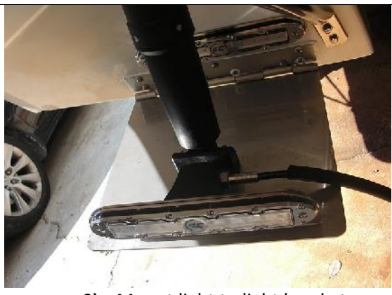
9) Mount light to light bracket