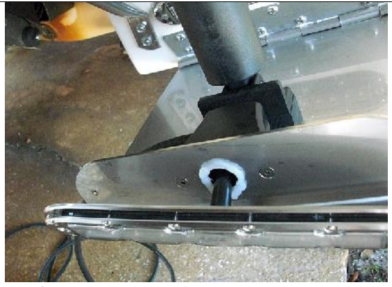
8) Install cable backshell with sealant on oring (not shown)