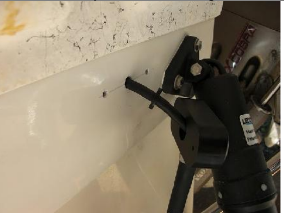
12) Route cable through hose and install transom fitting with seal washer and 4200 sealant.