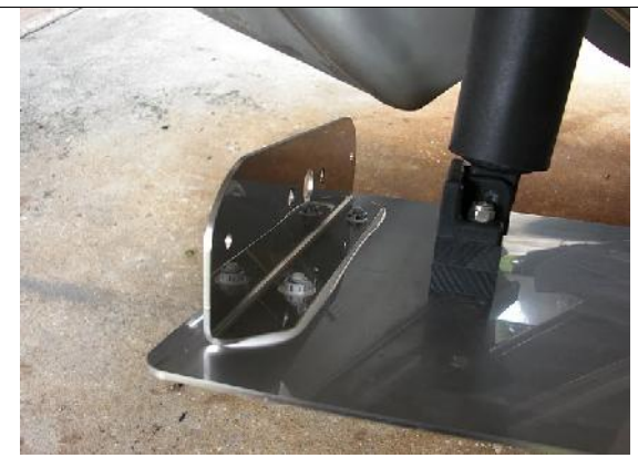
7) Light bracket installed on tab