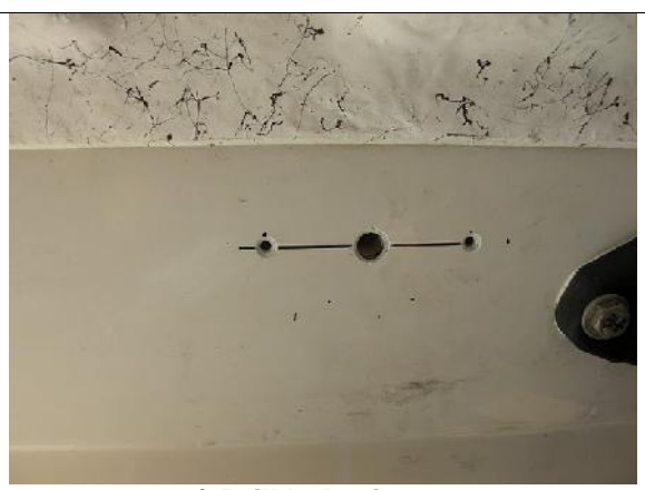
10) Drill holes in transom. Chamfer to prevent cracks in gel coat