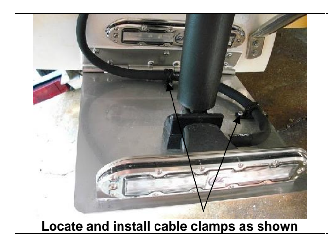
Trim Tab Mounting Kit installation is complete! Install wiring per ABYC guidelines.