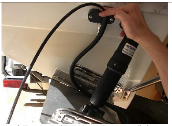
11) Temporarilly Mount Transom fitting and cut hose to proper length. Hose should be routed near trim tab hinge.