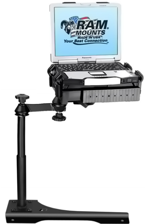
Complete Vehicle Mount RAM-VB-186-SW1

Installs in minutes with no drilling required Low profile keeps mount away from passenger leg space Lifetime warranty