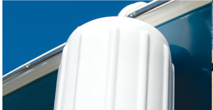
3/4" diameter center hole accepts up to 5/8" diameter rope to secure the fender