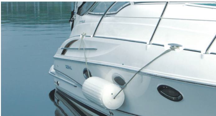
Horizontal hanging is useful for protection against pilings and tidal change areas