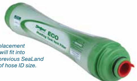
SeaLand ECO filter replacement cartridge (309311002) will fit into retaining fasteners of previous SeaLand ECO filter, regardless of hose ID size.