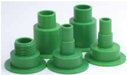
Dual-size hose adapters (5/8+3/4 in. combo, 1+1.5 in. combo) and threaded adapters make replacing previous vent filters easy.

Designed as a direct replacement for previous SeaLand and Dometic vent filters , the new ECO vent filter fits in the same installation brackets as older models. Hose adapters for the most popular vent hose sizes are included with the complete vent filter kit (309311001). Threaded adapters are also included for replacement on many older SeaLand holding tank systems with built-in vent filter.