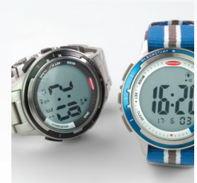
Stylish stainless steel models