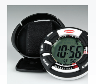
Removable timer unit