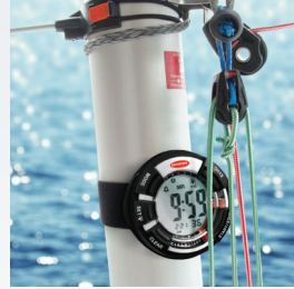
Mast mounting option