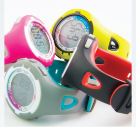
Compact 40mm models