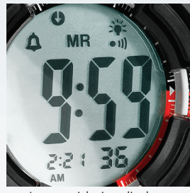
Large quick view displays