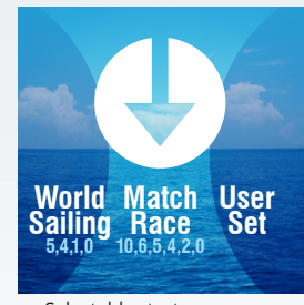
Selectable start sequences