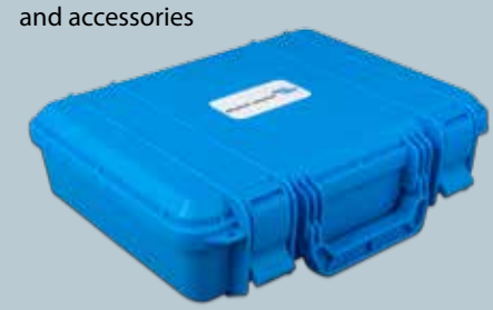
Carry Case for Blue Smart IP65 Chargers