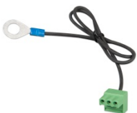
Connector with preassembled DC minus cable (included)

The BatteryProtect disconnects the battery from non essential loads before it is completely discharged (which would damage the battery) or before it has insufficient power left to crank the engine.