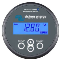
Bluetooth sensing BMV-712 Smart Battery Monitor