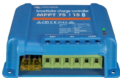
SmartSolar Charge Controller MPPT 75/15