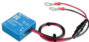
Bluetooth sensing Smart Battery Sense