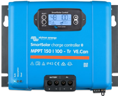
SmartSolar Charge Controller MPPT 150/100-Tr VE.Can with optional pluggable display