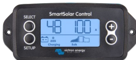
SmartSolar pluggable display

Simply remove the rubber seal that protects the plug on the front of the controller, and plug-in the display.