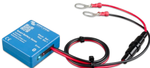
Bluetooth sensing: Smart Battery Sense