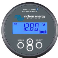
Bluetooth sensing: BMV-712 Smart Battery Monitor