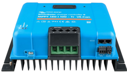
SmartSolar Charge Controller MPPT 150/100-Tr VE.Can without display