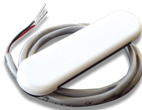
SCM-CL-RGB White and Black Full Color Courtesy Lights