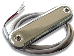
SCM-CL-RGB-SS Full Color Courtesy Lights