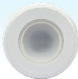
SCM-DL-CC Full Color Overhead Lighting (available in white or black)