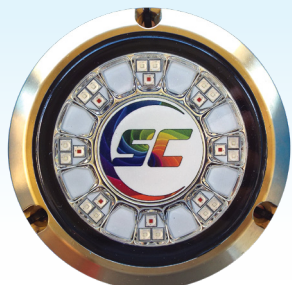
SCR-24-CC Full Color Underwater LED Lights