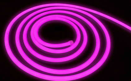
SCM-AL-NEON-08 | SCM-AL-NEON-16 Accent Lighting NEON Strip Available in 8' or 16'