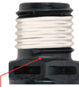
PRE-APPLIED FUEL-COMPATIBLE THREAD SEALANT